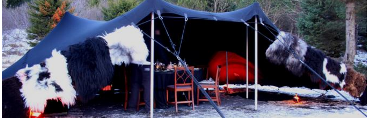
After getting the taste of old times runes it's time for the viking story telling. To make it real one of the strongest men in Iceland will show feats of strength to symbolize the forces of nature.