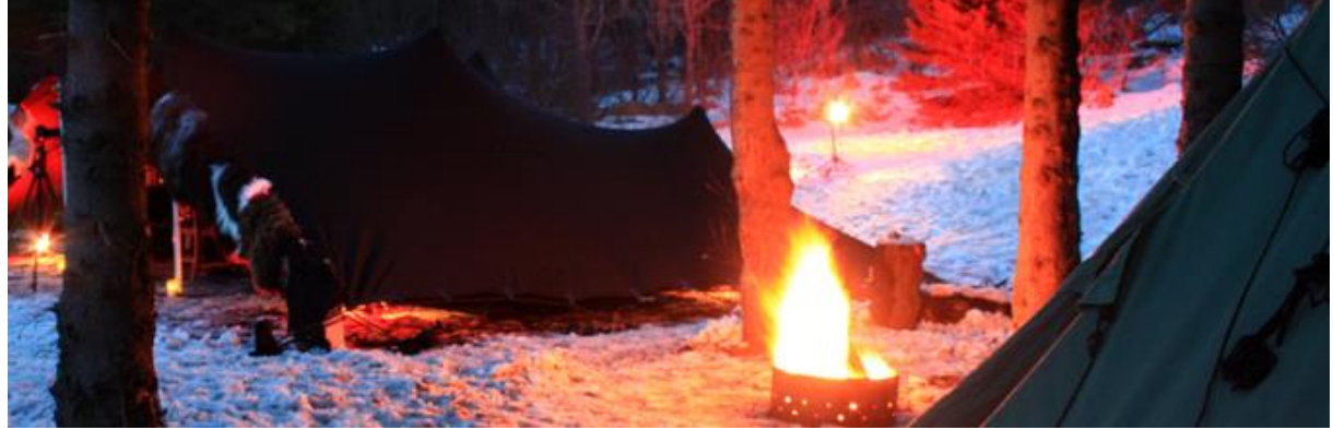
You will enjoy a rune reading that is a type of a fortune telling but the Vikings of the old used the runes for magical purposes among other for the runes were believed to be deeply entwined with the heathen gods of the old. This unique experience will give you a better idea of Icelandic nature.

Enjoy a complete private set up with gourmet dinner with a private chef arranging a four course luxurious meal with good wines. We decorate the dining table with lava stones and wild plants and heaters and lights giving a cosy atmosphere. Our dinner is a blend of local and French cuisine and is created by one of our best's chefs in Iceland.