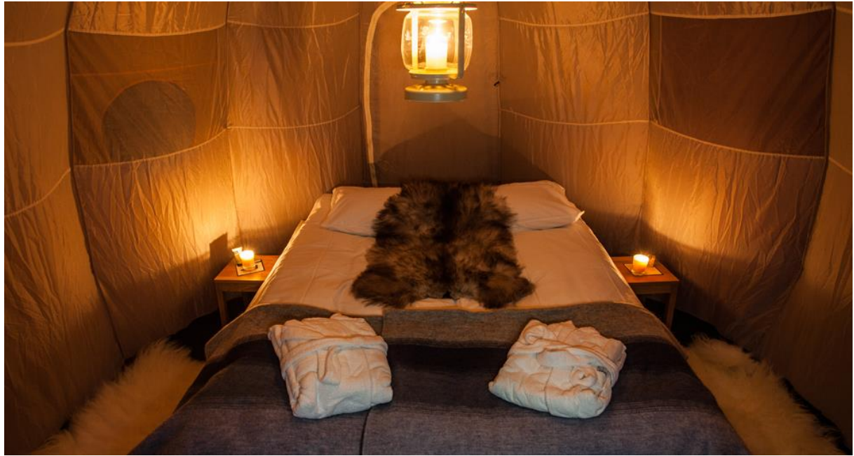
In the camp you have a sauna where you can relax after a busy day experiencing the Icelandic nature, a hot water shower and a toilet.